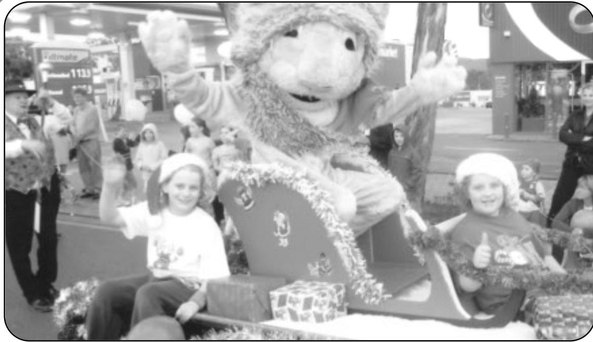
◆ The Lions' float at last year's Blackwood Christmas Pageant