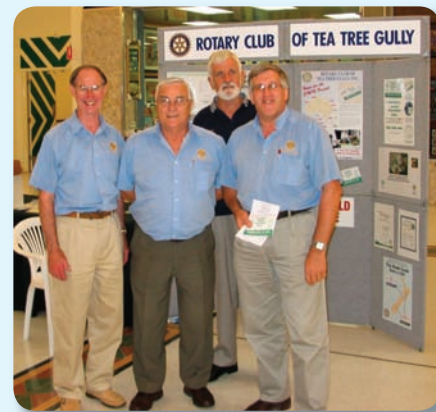
'Recent shopping centre promotion of the EMIB Project.'